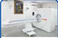
Rotary Rajkot Greater CT Scan Centre at B T Savani Kidney Hospital